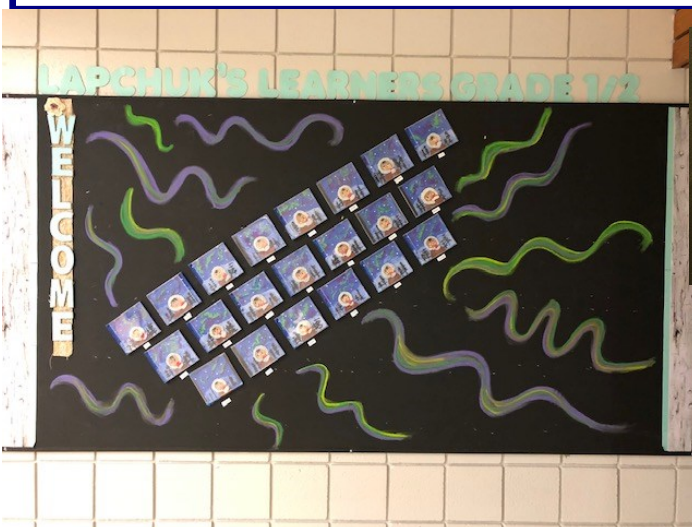
Barbara Reid Art By Grade 1/2 and Grade 1